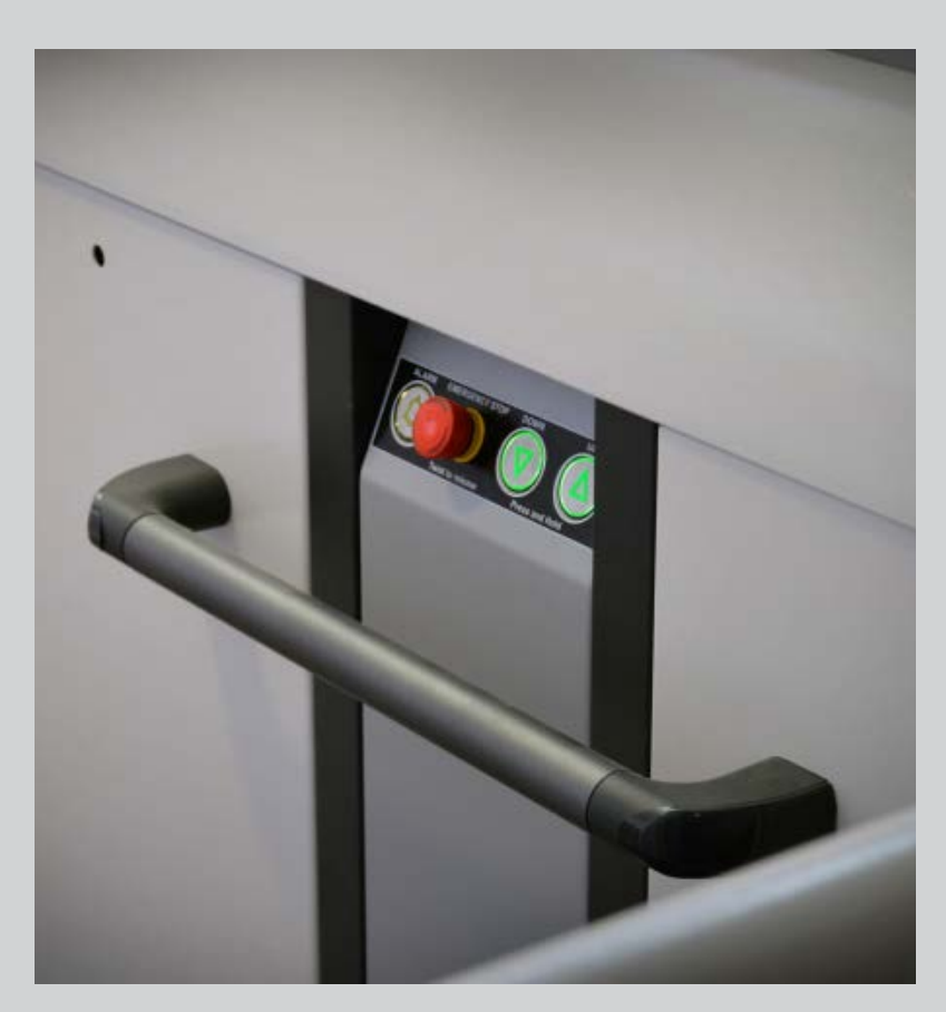
High Spec Controls