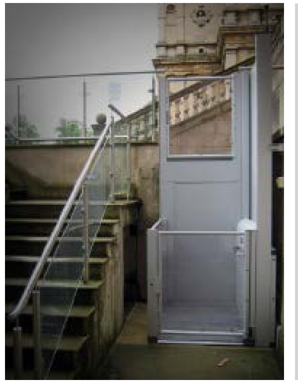
5 year Anti-corrosion Warranty