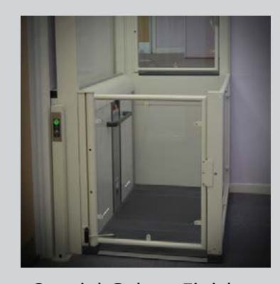
Special Colour Finishes