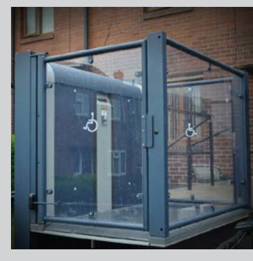
Plexi - Glass Side Barrier