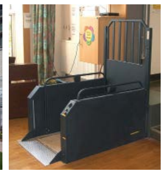
Other lifts available from the Wessex