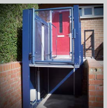
Plexi - Glass Gates